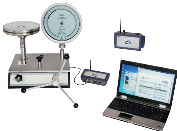
Model CPU6000-W, CPU6000-S, CPB5800 and PC with WIKA-Cal software

For details of the different pressure balances see data sheets CT 31.01, CT 31.06, CT 31.11, CT 31.51 and CT 31.56