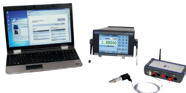
WIKa-Cal with model CPC3000 pressure controller, pressure sensor with model CPU6000-M CalibratorUnit

For details about the various pressure controllers see data sheets CT 27.40, CT 27.55, CT 27.61, CT 27.62 and CT 28.01