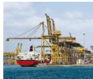
CRANES & OVERHEAD CRANES

In addition to foreseeing the market's application needs, Gefran forms partnerships with its customers to find the best way to optimise and boost the performance of various applications.