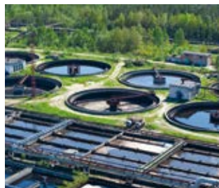
WATER & HVAC